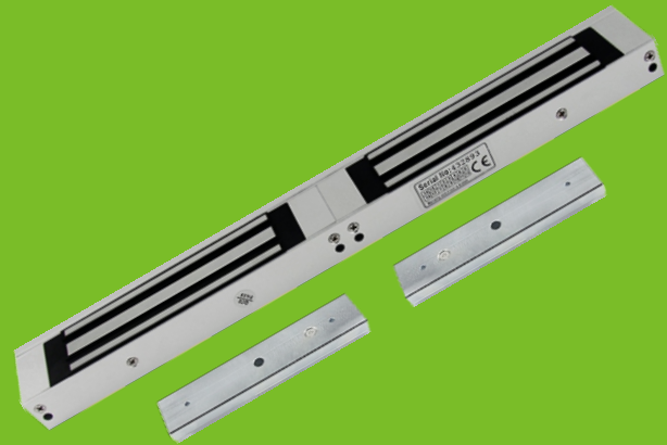
EL-350D, EL-350DS, EL-350DST